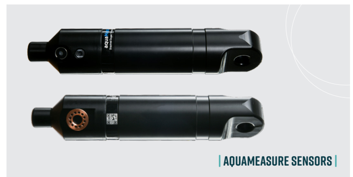
| AQUAMEASURE SENSORS |